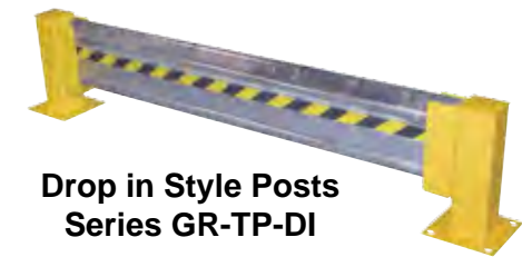
Drop in Style Posts Series GR-TP-DI