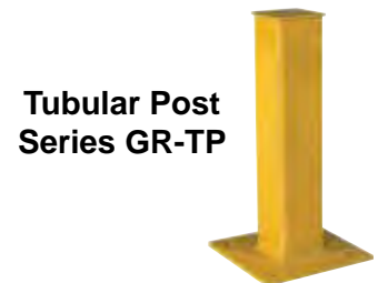
Tubular Post Series GR-TP