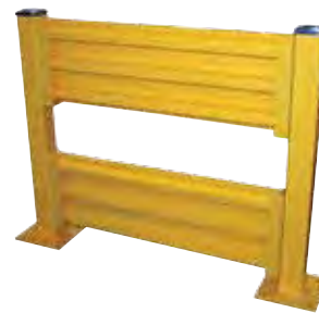
Drop-in style YGR-LO-4 & YGR- TP42-S (2 ea)