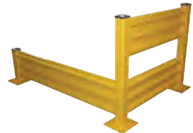
Bolt-on style YGR-LO-4 (qty 2), YGR-TP42-S, YGR-TP-42-C, YGR-LO-6, YGR-TP18-S.