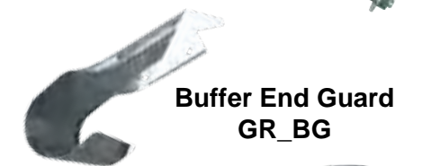
Buffer End Guard GR_BG