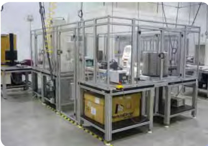
Medical Application with Smooth Extrusion for Workcell Tables and Enclosures