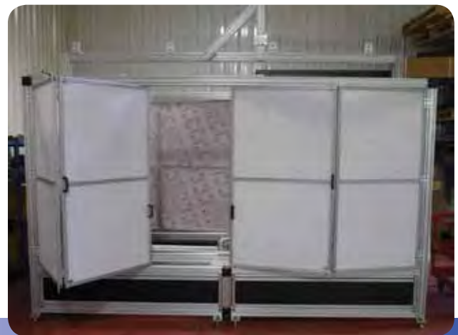
Machine Enclosure with Bi-fold Doors