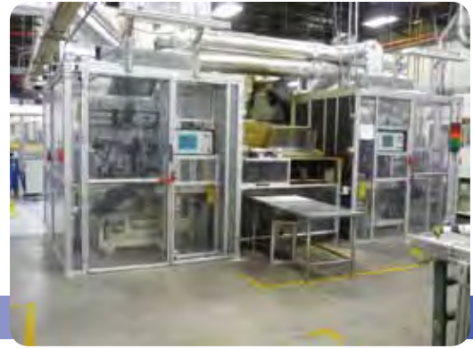
Custom Climate Control Enclosure with Insulation on Inside Walls, Lighting and Conveyor Cover Between Units