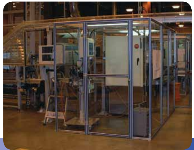
Climate-Controlled Printer Enclosure