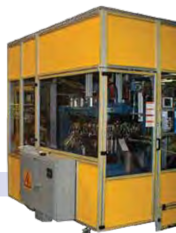
Sound and climate control area