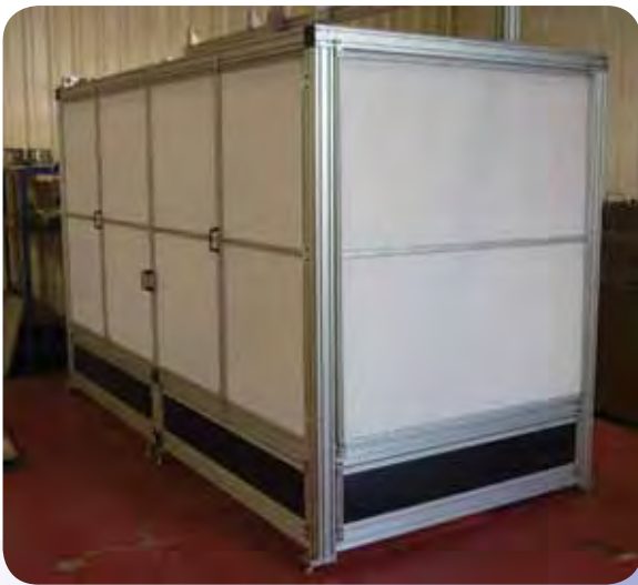
Machine Enclosure with Doors Closed