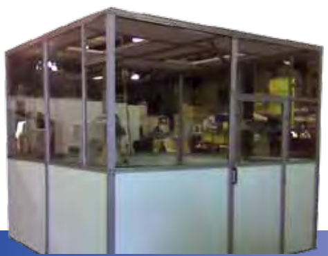
Climate controlled CMM enclosure