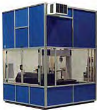
Climate controlled CMM enclosure