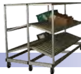
Double-sided Tote Cart