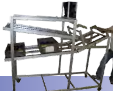
Tote Fill Station and Transfer