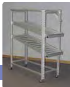
Adjustable Gravity Flow Rack