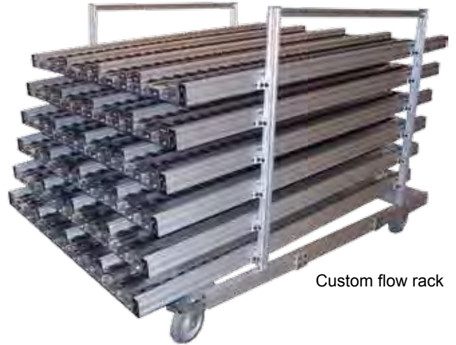
Custom flow rack