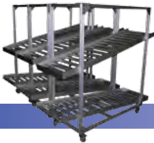
Lean Manufacturing Gravity Rack