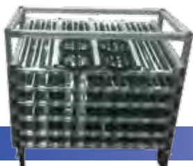
Auto Seal Material Flow Rack